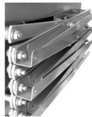
wire-slot for cable management