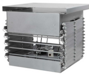
B515AS without wire-slot