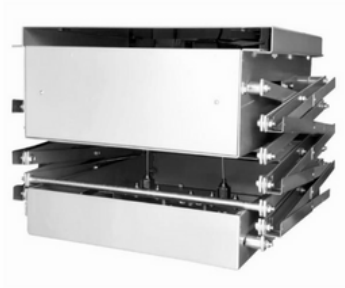
B530AS with wire-slot